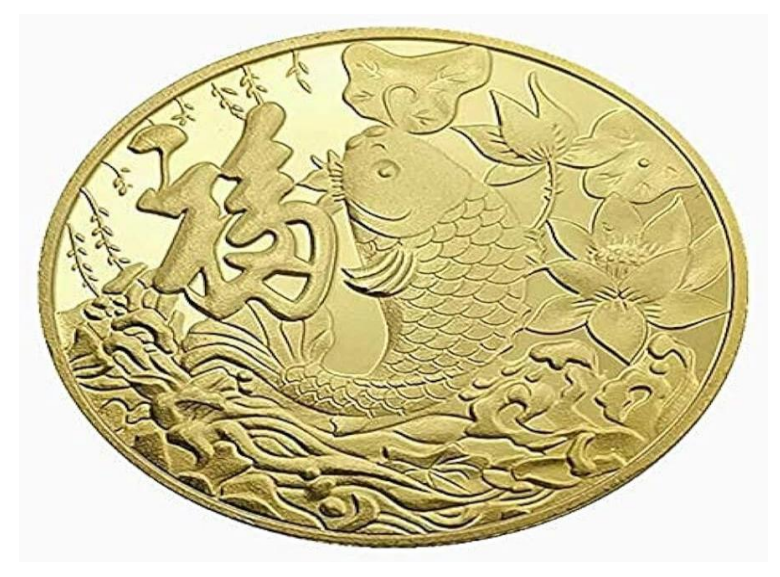
Figure 3: Fish Coin

sold or the digital record from being transferred to the next buyer. At the time of harvest, while entering another nation, or at other stages in the chain, government inspectors or reliable non-governmental organizations (NGOs) who have no interest in fisheries earnings might verify the digital record. Fish Coin would make it simple for fishermen to convert Fish Coin into cash or mobile phone airtime, as many fishermen are unlikely to value tokens that would be published on cryptocurrency exchanges.