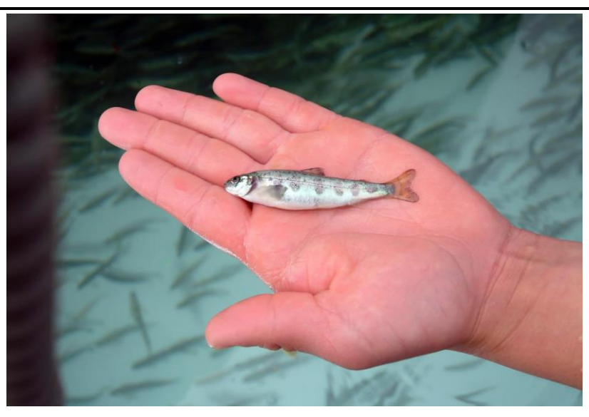
Figure 1: Fish tracking system