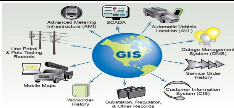
Figure 1: Geographical Information Systems (GIS)