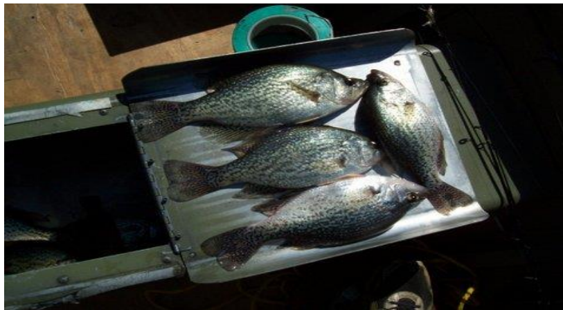
Figure 3: GIS and Fish

Large volumes of data are gathered over time and may be utilized to monitor migratory patterns, spawning sites, and preferred habitats. Previously, this data would be manually mapped and superimposed. This data may now be stacked, arranged, and analyzed in a previously impossible way by entering it into a GIS application. A GIS program's layering feature enables a scientist to examine many species simultaneously to identify potential watersheds that these species share or to single out one species for more research. In collaboration with other organizations, the US Geological Survey (USGS) was able to map the pallid sturgeon habitat regions and migratory patterns with the aid of GIS. To monitor sturgeon movements and expedite data gathering, the Columbia Environmental Research Centre uses a customized version of ArcPad and ArcGIS, both ESRI (Environmental et al. Institute) programs. A relational database was created to handle tabular data for every single sturgeon, including initial catch and reproductive physiology. It is possible to make movement maps for certain sturgeon. These maps make it easier to follow each sturgeon's path throughout time and place. This made it possible for these researchers to plan and prioritize the work of field staff in order to monitor, map, and recapture sturgeon (Figure 3).