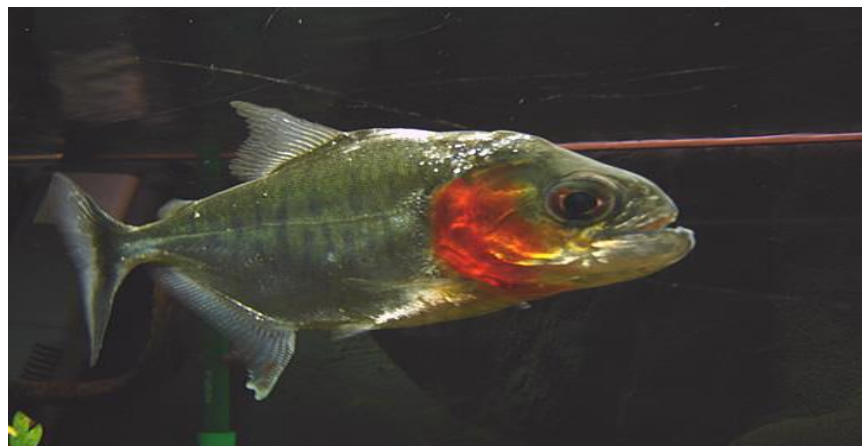
Figure 1: Serrasalminae

of molecular markers for performing assessment studies on aquatic species for the conservation of the aquatic population(Wenne, 2023).