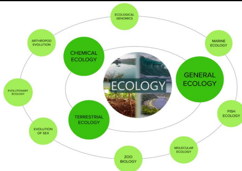
Figure 2: Ecology