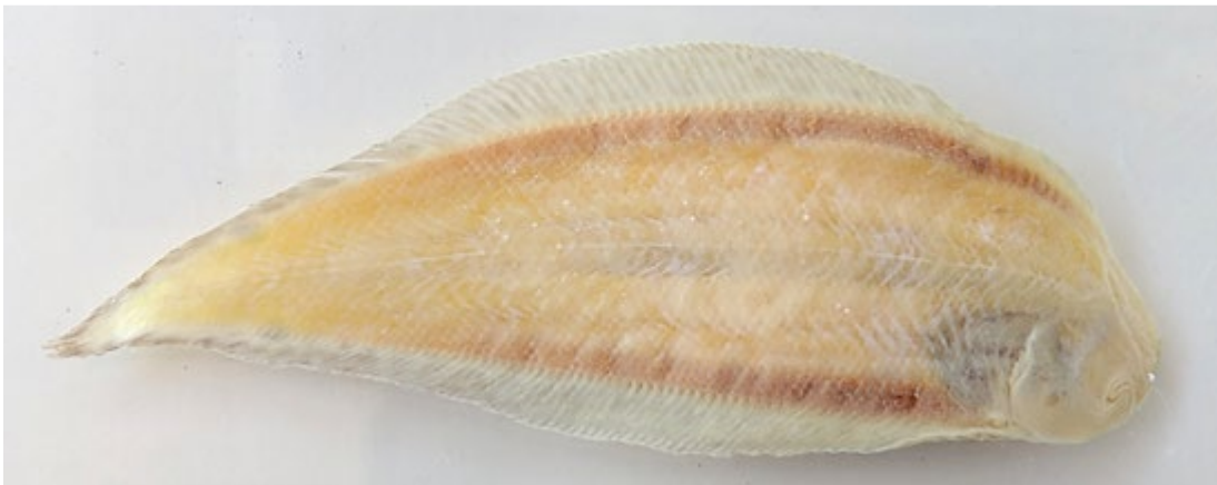
Figure 2. Cynoglossus quadriocellatus new species, holotype, WAM P.31854-004, 152.3 mm SL, Western Australia, Dampier Archipelago, 5.8 nautical miles northeast of Rosemary Island. Blind side.