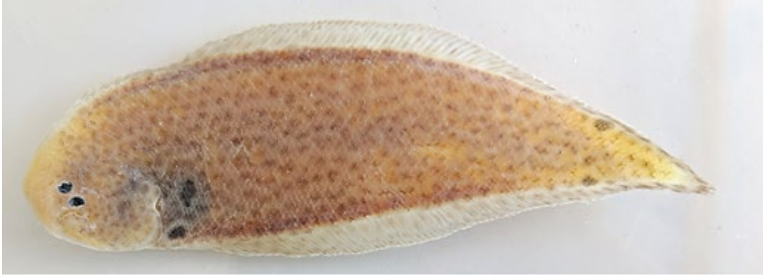
Figure 1. Cynoglossus quadriocellatus new species, holotype, WAM P.31854-004, 152.3 mm SL, Western Australia, Dampier Archipelago, 5.8 nautical miles northeast of Rosemary Island. Eyed side.