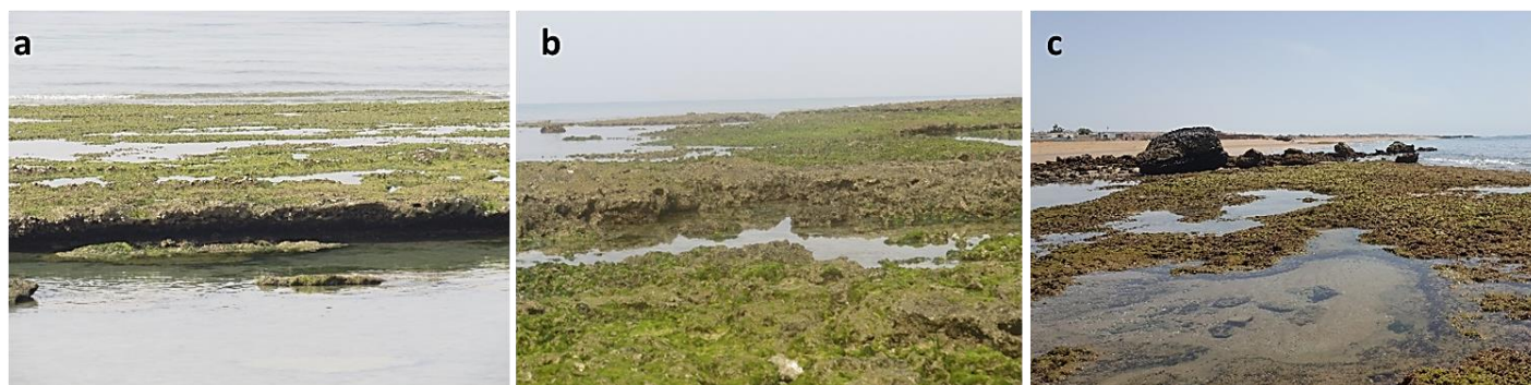
Figure 3. Natural habitats of Coryogalops tessellatus . (a) Bushehr, Dayyer, (b) Parsian, Bostanu, and (c) Qeshm Island, Messen.

part of body white with dark brown edges on scales, head brown, finely mottled with small whitish and dark brown spots; lower part of head with a series of dark brown spots; the largest two on lower opercle and subopercle; a series of dark brown blotches along edge of preopercle; first dorsal fin white with a narrow irregular diagonal blackish and yellowish band from first to base of fourth spine, a narrow whitish band above this, then a broad yellowish band, outer edge of fin white; second dorsal fin brown, shading to light brown distally, with numerous small irregular whitish and brownish spots and an irregular row of small dark brown spots along base; pectoral fins pale brown with a few small indistinct brown spots at base; anal fin colored like second dorsal fin on basal half, light brown on outer half; pectoral fins pale brown with a few small indistinct brown spots at base; pelvic fins with brown rays and dark brown membranes.