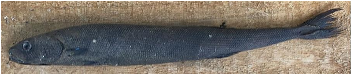
Figure 2. Specimen of Tetragonurus cuvieri , 39.2 cm TL, from Mersin Bay (MEUFC-22-11-134).