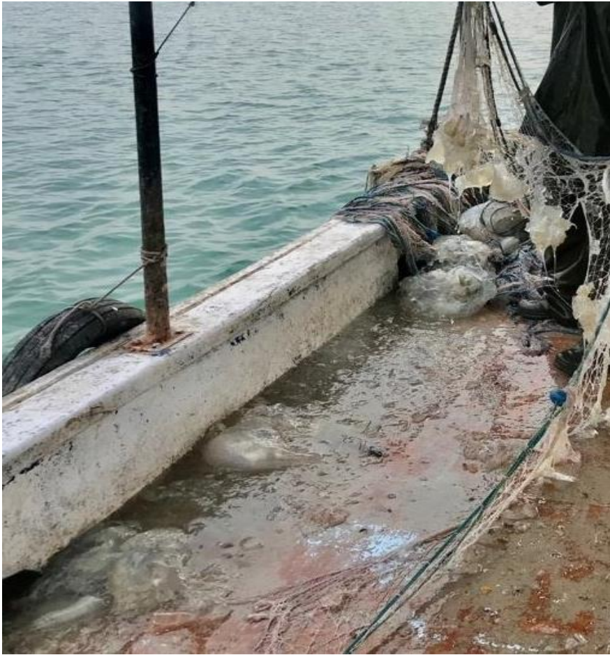
Figure 3. Individuals from populations of Lessepsian jellyfish Rhophilema nomadica caught in trawling with Tetragonurus cuvieri .

(2021) reported that young individuals of the species live together with pelagic tunicata such as Salpa and Pyrosoma (in their nests), while adults live alone.